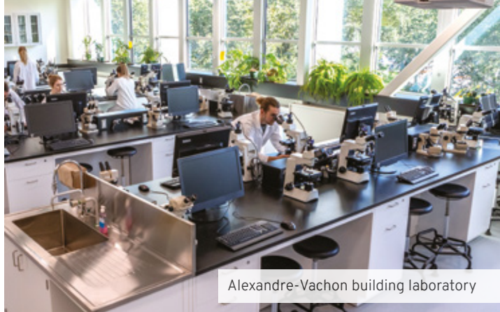
Alexandre-Vachon building laboratory

Choosing Université Laval means enjoying an equitable, diverse, and inclusive learning environment where you can reach your fullest potential. We go to great lengths to ensure that everyone feels welcome, respected, and valued. Training is offered to the entire university community to help raise awareness of equity, diversity, and inclusion and build a culture free of discrimination.