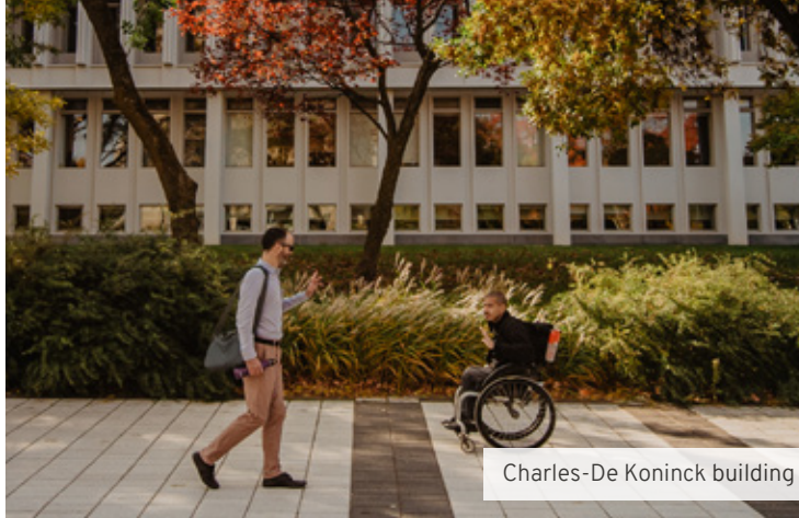
Charles-De Koninck building