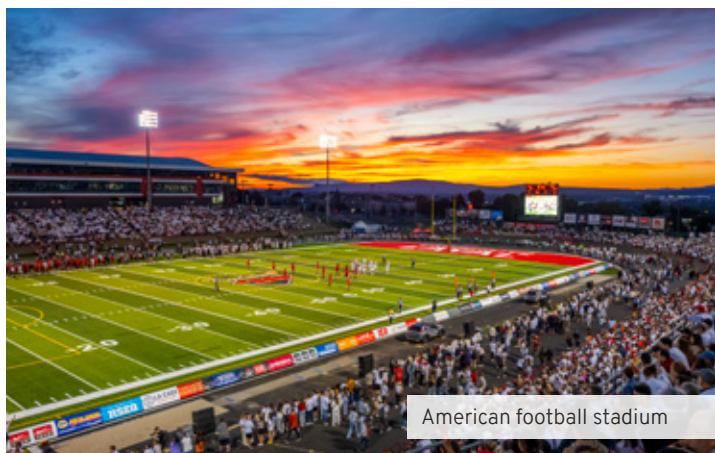
American football stadium