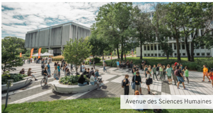
Avenue des Sciences Humaines

A team is on hand in the residences and on campus to keep the university community safe and provide assistance if necessary.